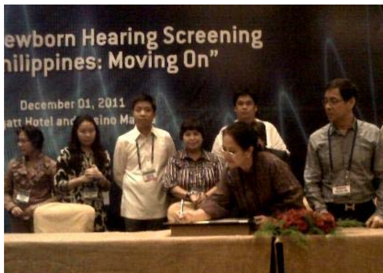
COO/ Past President co-signing of the launch of the Newborn Hearing Screening program in the Philippines, Manila 1 December 2011