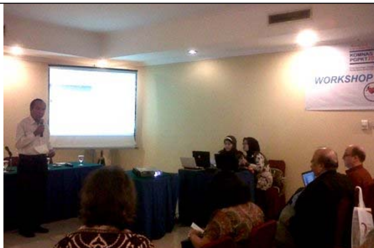
Presentation at the Indonesian Strategic Plan Workshop at Bukittinggi 26th September 2011