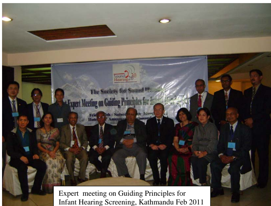
Expert meeting on Guiding Principles for Infant Hearing Screening, Kathmandu Feb 2011